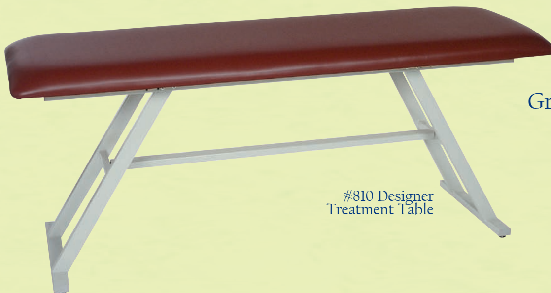
#810 Designer Treatment Table

Sleek Design and Durability at an Affordable Price