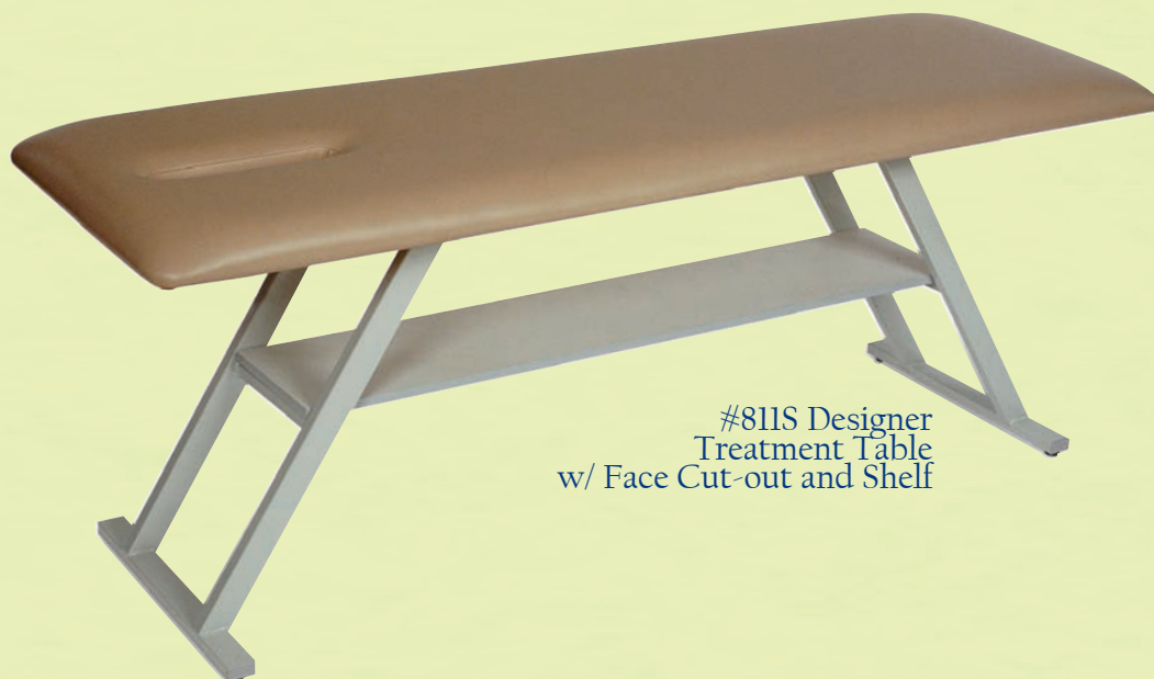
#811S Designer Treatment Table w/ Face Cut-out and Shelf

Quality tables. Great standard features. Outstanding value.